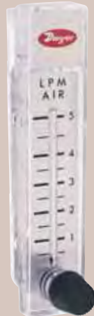
Model RMA-SSV 2" scale, 4-13/16" high