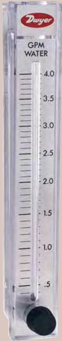
Model RMC-SSV 10" scale, 15-3/8" high